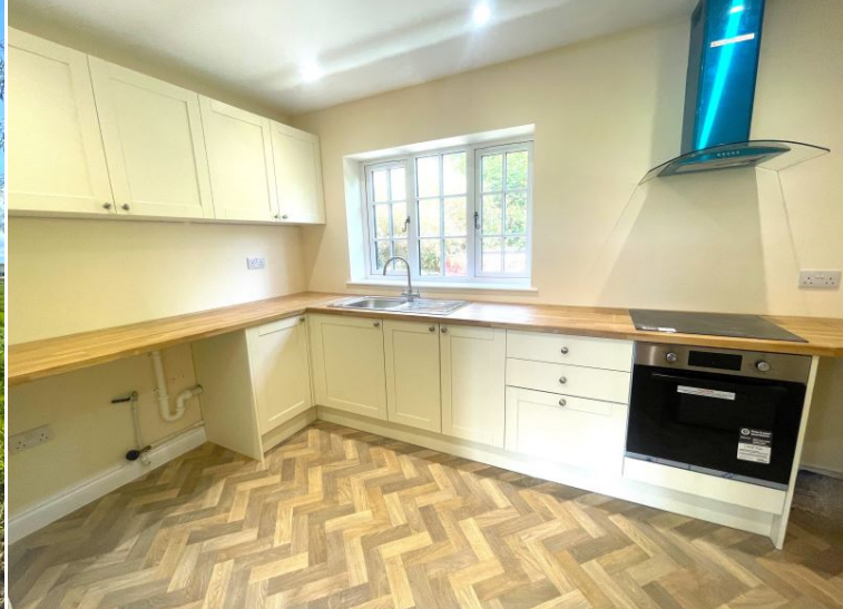
Broad Street Common