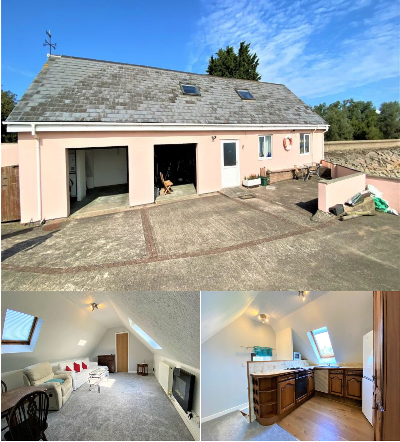
Seawall, , Goldcliffe, NP18 2PH

Rental £900 Monthly 2 Bedroom Flat / Apartment Available 01 August 2024