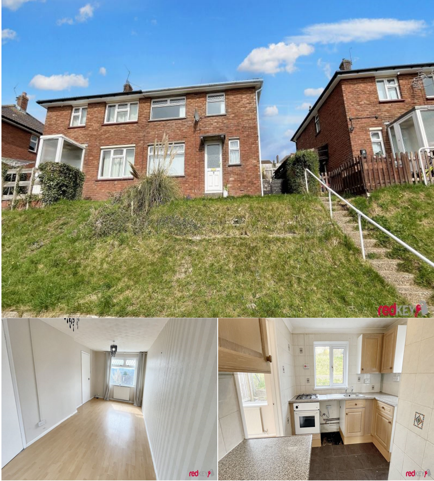
Ty Du View , Rogerstone, Newport, NP10 9BQ

Rental £895 Monthly 1 Bedroom House Available 03 April 2025