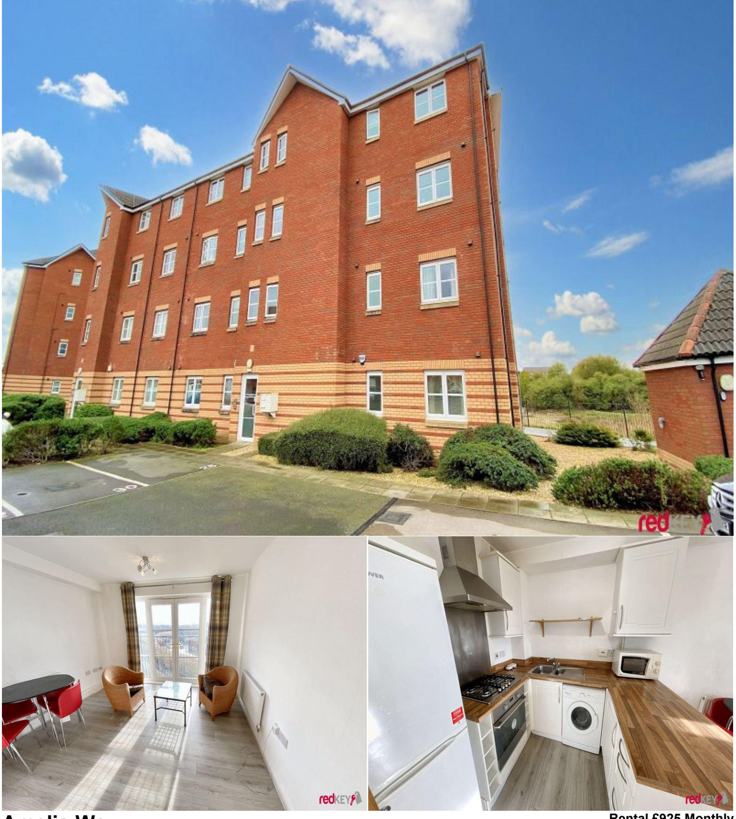
Amelia Way , Newport, Gwent, NP19 0LR

Rental £925 Monthly 2 Bedroom Flat / Apartment Available 30 June 2025