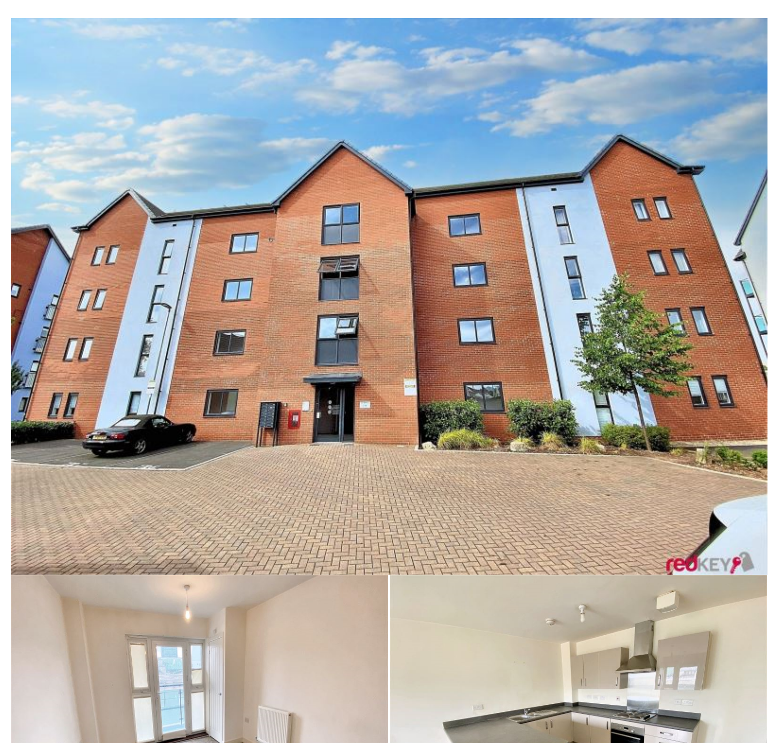
The Raphael , Newport, NP19 0PP

Rental £995 Monthly 2 Bedroom Flat / Apartment Available 21 June 2025